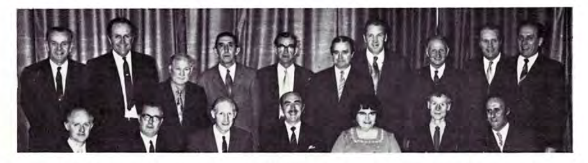
Awards for 35 years and 25 years were presented to these members of the South Lancashire District, above , and the Mid-Cheshire District, below .