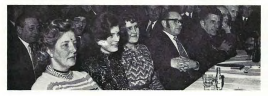
North Mersey Staff Meeting