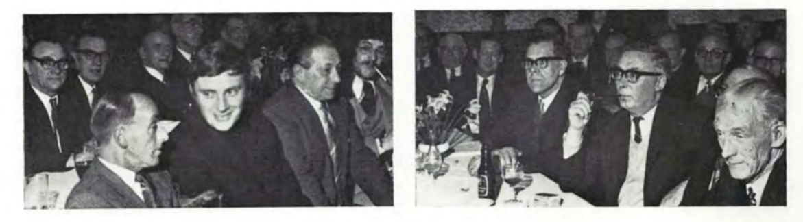
Round the tables at the